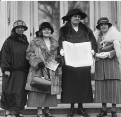
1924 Peace Petition delegation

Hidden History www.welshwne.org/events/hidden-history-event